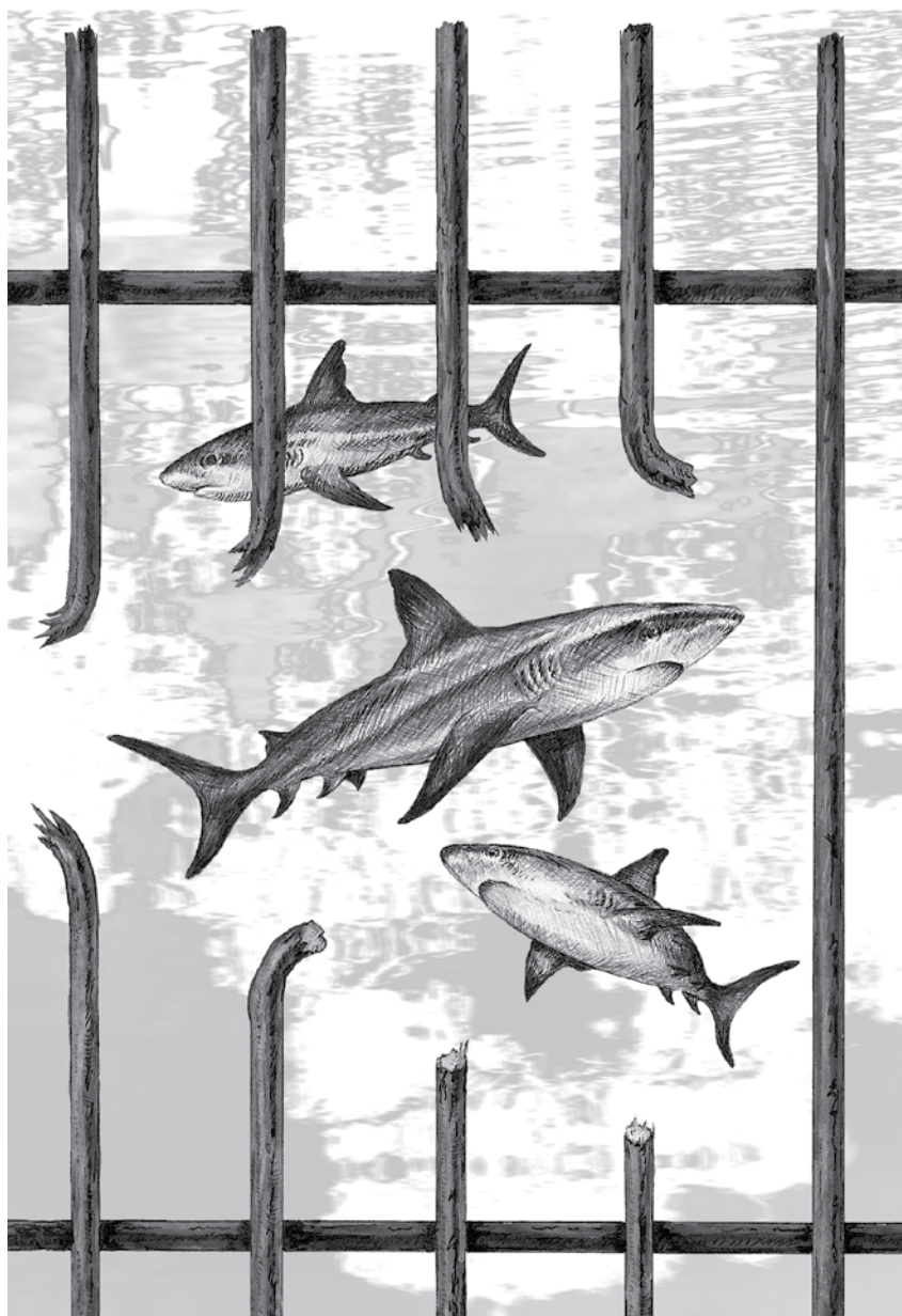
Illustration: © Savina Hopkins.

Imagine there are two girls in a bar. Sally has a strong Shark Cage with a good alarm system. Chantelle has a Shark Cage with lots of missing bars, rusty weak bars and a dodgy alarm system. There is a shark in the pub,